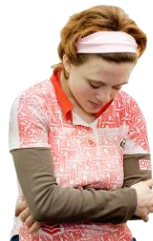
Mental Health services