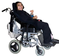
People with a disability