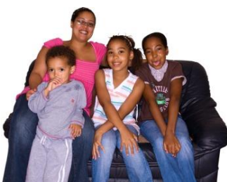
Families and children - including fostering and adoption